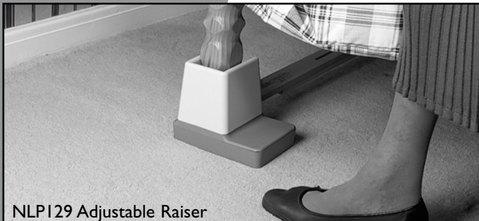
NLPI29 Adjustable Raiser