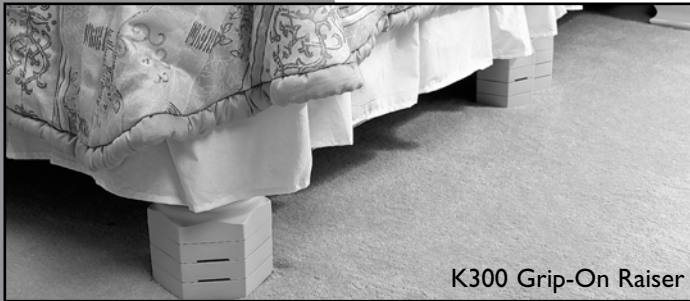
K300 Grip-On Raiser